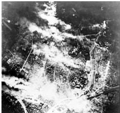
Tokyo burns under B-29 firebomb assault