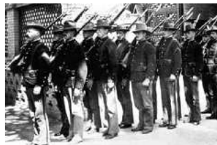
U.S. Marines - Part of the international relief expedition sent to lift the siege of Peking.